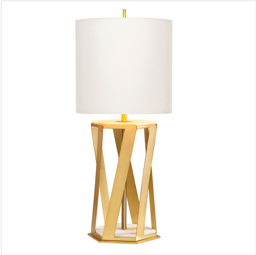
APOLLO-TL-WHT Apollo 1 Light Table Lamp with White Shade - Brushed Brass